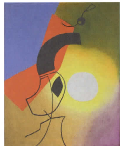
from Sun Triptych