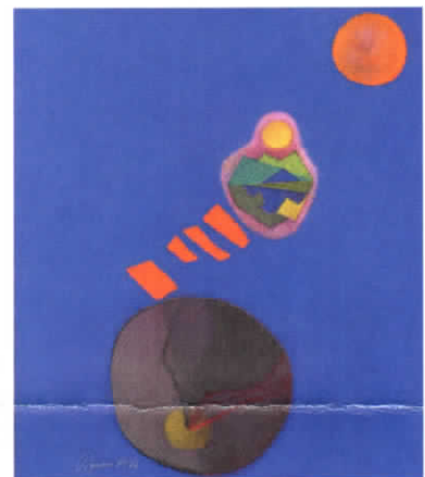
Shadows, Stars, Vastness