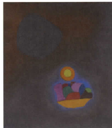
The Morning Star Tinges the Sky Red