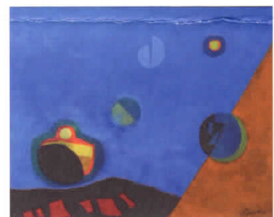
Magnificence of Heaven